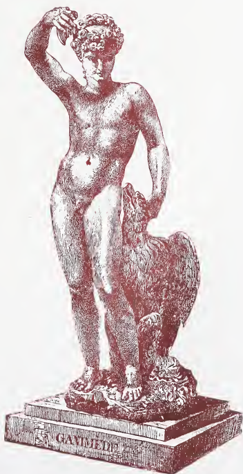
ANTIQUÉ GANYMEDE RESTORED BY CELLINI.